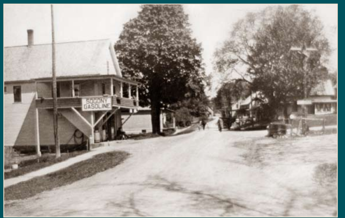
The Louis S. Gordon Store, built 1907, sold groceries, provisions and grains. The building remained vacant in early 2000s, and was donated in 2006 to The Big Heavy World Foundation for its Vermont Music Library.