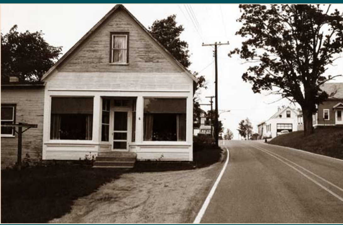
Starksboro village scene at the turn of the 20th century.